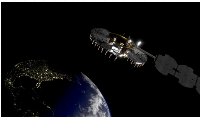
Artist's concept for NTS-3 in geostationary orbit. Harris Corporation will integrate NTS-3 using Northrop Grumman's ESPASStar bus, building on EAGLE's flight heritage.

PNT is a key mission area for the Air Force Research Laboratory (AFRL) in New Mexico. Together with industry, we are developing advanced